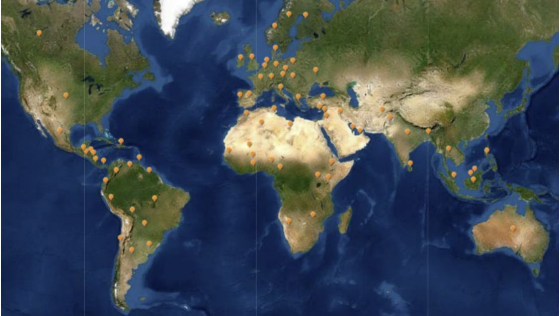
Global Congress Network Country Representation As of August 2022