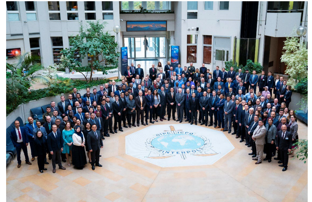
Members of the Global Congress on Chemical Security and Emerging Threats INTERPOL HQ Lyon, France, 2019