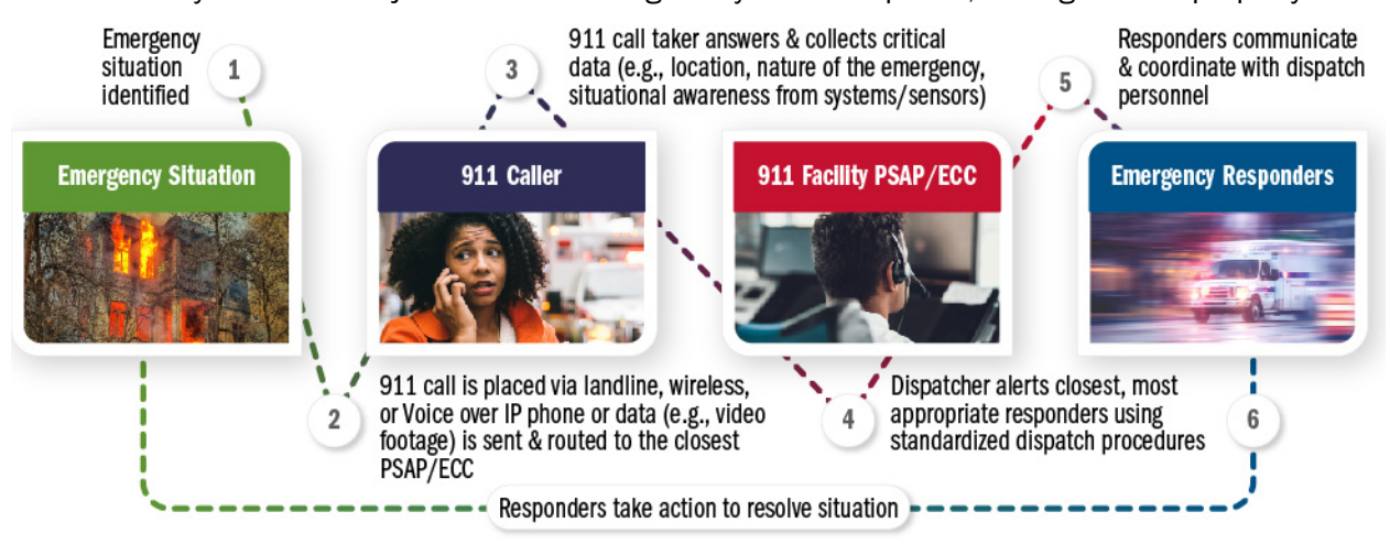
Figure 1: Mission-Critical Communications during Emergency Response

Every day dedicated public safety responders risk their lives to make our communities safe and secure. Emergency responders at every level of government—federal, state, local, tribal, and territorial—must respond to and manage incidents of varying size and scope and assist communities with recovery efforts. This mission requires timely decision-making and coordination among law enforcement, fire, emergency medical services personnel, 911 staff, emergency managers, and medical professionals. As Figure 1 represents, multiple response agencies may be involved in a single incident. Communications is a mission-critical part of that response; a breakdown of communication at any one of these junctures could negatively affect response, risking life and property.