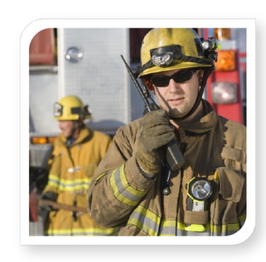
Figure 1: First Responder Using LMR

Emergency responders must have consistent, resilient, and interoperable mission-critical voice communications systems to respond to citizens' calls for services and enhance personnel safety. LMR systems have been deployed since the 1930s to meet this critical need, and LMR continues to be public safety's primary means of voice communications (Figure 1). As communications technologies have evolved, LMR has introduced new features, enhancements, functionalities, and low-speed data capabilities to ensure system-level sustainment. Additionally, Project 25 (P25) accredited technical standards help ensure LMR systems and equipment are compatible and interoperable with other P25-compliant systems. In recent years, wireless data communications systems using different technologies have been deployed to supplement traditional LMR