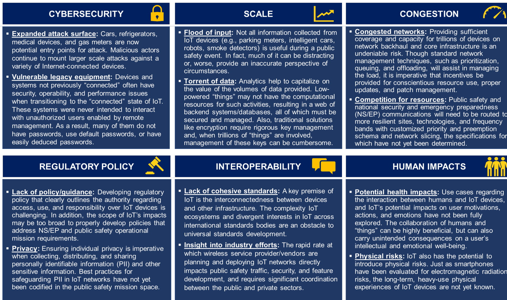
Figure 1. IoT Concerns (Non-Comprehensive)

The challenges to implementing IoT within the public safety context are substantial. From cybersecurity to privacy risks, IoT is inspiring profound concerns for society in the Internet age. Addressing these concerns will require the collaboration of government, industry, and academia to provide ever-evolving risk assessment and mitigation of these consequences before they occur.