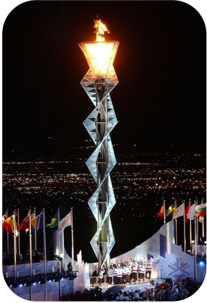
The 2002 Olympic Torch