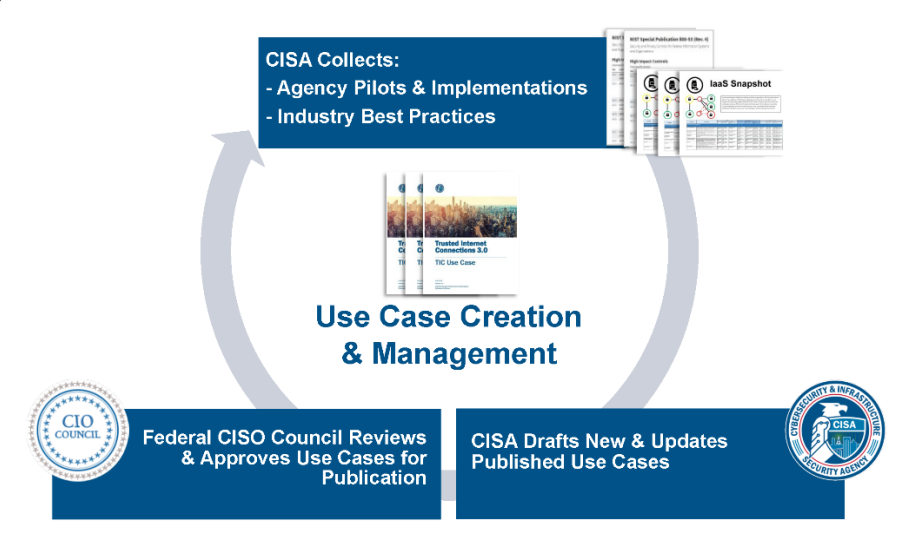
Figure 2: Use Case Creation Process

CISA is responsible for creating use cases, and the Federal CISO Council TIC Subcommittee is responsible for their approval. CISA may produce use cases from agency pilots or implementations. CISA, in coordination with stakeholders, will update use cases over time to reflect changes in technology or feedback from agencies and service providers. The process for creating and managing use cases is depicted in Figure 2.