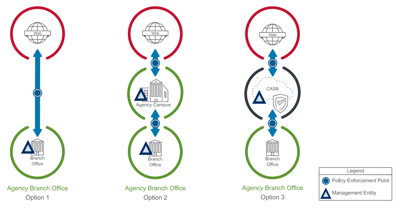
Figure 3: Example Security Pattern Implementation Options

Figure 3 provides an example set of implementation options for a security pattern linking the web and a branch office. While the implementation options in a use case typically apply to the most common agency deployments, agencies may implement other options, based on their unique needs. Agencies are encouraged to explore the variety of security patterns typically included in TIC use cases.