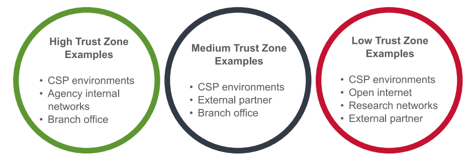
Figure 4: Trust Level Designation Examples

Each trust zone in a use case will be labeled with a high, medium, or low trust level, based on a pilot implementation or best practice. Agencies can modify this trust zone designation to meet their needs based on their risk tolerance and depending on their considerations for a specific scenario. For example, a use case might designate a cloud service provider (CSP) as medium trust zone, but an agency may consider a CSP to be a high trust zone based on unique circumstances, like stronger contractual terms that provide greater visibility into its CSP. Additional examples of how the same type of environment can have a different trust level designation are depicted in Figure 4.