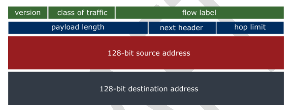
Figure 2: IPv6 Packet

IPv6 simplifies IPv4 headers and provides greater flexibility with the introduction of optional extension headers. These headers provide options for functions such as packet fragmentation, authentication, and mobility. IPv6 optional extension headers are designed to be chained together after the main IPv6 header. The IPv6 packet is depicted in Figure 2.12