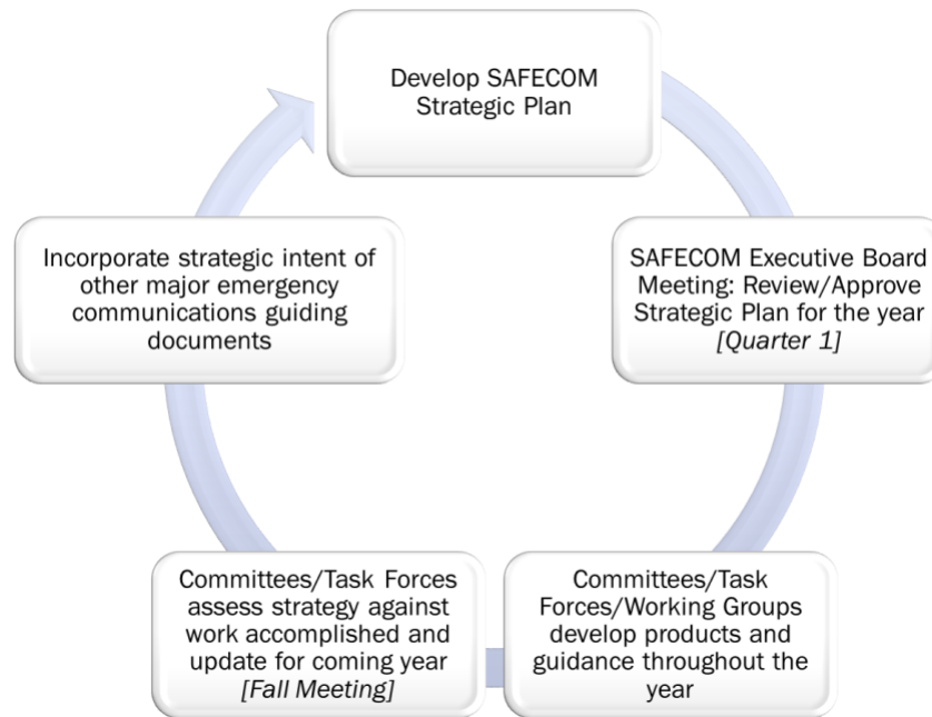
Figure 3: Strategy Implementation Cycle for the SAFECOM Strategic Plan.

SAFECOM will use regularly scheduled Executive Board and bi-annual SAFECOM meetings to work closely with the committees, working groups, and task forces assigned to specific goals and initiatives. As a result, committee chairs will regularly report to the SAFECOM Executive Board on their identified goals and initiatives throughout the year to ensure success.