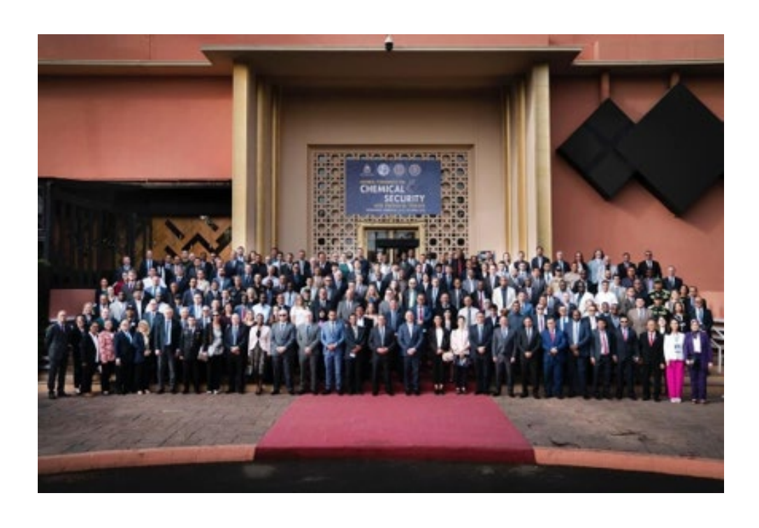
Members of the Global Congress on Chemical Security and Emerging Threats Marrakesh, Morocco, October 2022