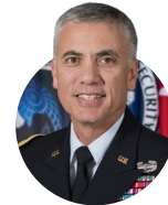
GENERAL PAUL M. NAKASONE Former DIRNSA

the ESF was established to be the premiere forum to address cybersecurity issues facing the nation, government, and industry. Neither government nor industry can do it alone; the reliance on each other fortifies the need for government and industry partnership.