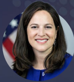
ANNE NEUBERGER First ESF Chief

The ESF broke new ground in showing what was possible in a partnership between the public and private sectors. Across chipset, software, and hardware, millions of laptops, computers, and servers were protected against an imminent threat. This initial spark began a partnership that utilizes a cooperative model for identifying relevant constituencies and how they can best serve each other.”