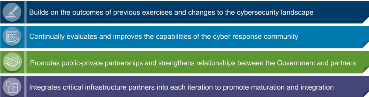
Figure 1: Cyber Storm Exercise Series Benefits

Today’s dynamic cyber threat environment requires constant reassessment of our nation’s cyber incident response capabilities. Cyber Storm IX will examine all aspects of cyber incident response by depicting a coordinated cyberattack impacting critical infrastructure system confidentiality, integrity, and availability. Organizations will evaluate internal cyber incident response plans, while coordinating with those at the federal, state, local, and private sector levels. Throughout the exercise lifecycle, participants work together to identify applicable strengths and weaknesses, and ultimately find solutions to strengthen their cybersecurity preparedness.