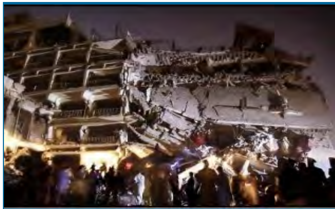
Figure 7: Pearl Continental Hotel in Peshawar, Pakistan, following the 2009 Vehicle-Borne IED (VBIED) that killed 11 people and injured at least 50 others.