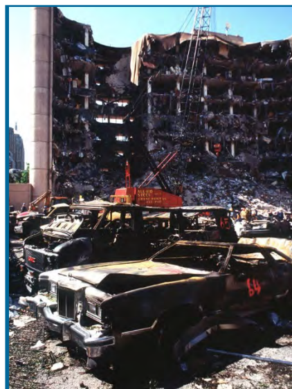
Figure 6: The Alfred P. Murrah Building following the 1995 bombing in Oklahoma City that killed 168 people and injured more than 500. Property of DHS

For more information on threat and detonation responses, see Appendix 2.