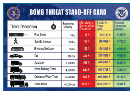
Figure 5: Bomb Threat Stand-Off Card

If an IED threat is determined to be credible, establish a cordon around the object to keep staff and attendees away from the area. Consider implementing the pre-evacuation protocol in the emergency action plan as a precaution. This includes conducting a secondary sweep for additional suspect IEDs along the evacuation routes and preparing reception areas. In the event of a successful IED detonation, keep attendees in their seats to the extent possible, given the concern of secondary devices along egress routes. If the decision is made to evacuate attendees, identify egress points as far from the blast as possible and direct the evacuation accordingly. For more information on IED evacuation distances, see Appendix 2.