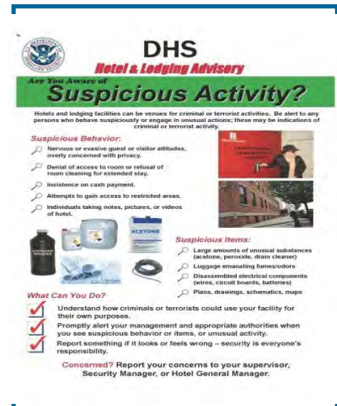
Figure 4: OBP Awareness Poster

If the threat is elevated (e.g., if an event involves a controversial figure or organization), consider issuing reminders to staff or conducting ad-hoc refresher training. DHS has developed a wide variety of materials, such as training videos, posters, and checklists, that lodging facilities can use to supplement their IED training efforts. See Appendix 2 for a list of available resources.