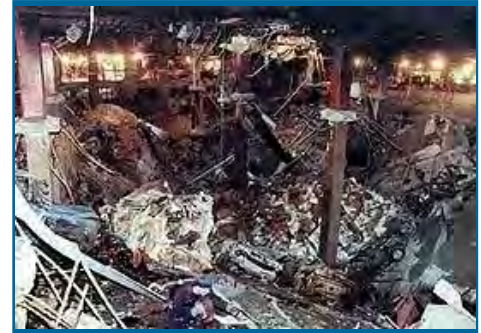
Figure 1: World Trade Center parking garage following the 1993 bombing that killed six people and injured 1,000

Goal 7: Safely coordinate response activities at IED incident sites. These C-IED tasks include activities by which lodging personnel can effectively and safely react at the IED incident site.