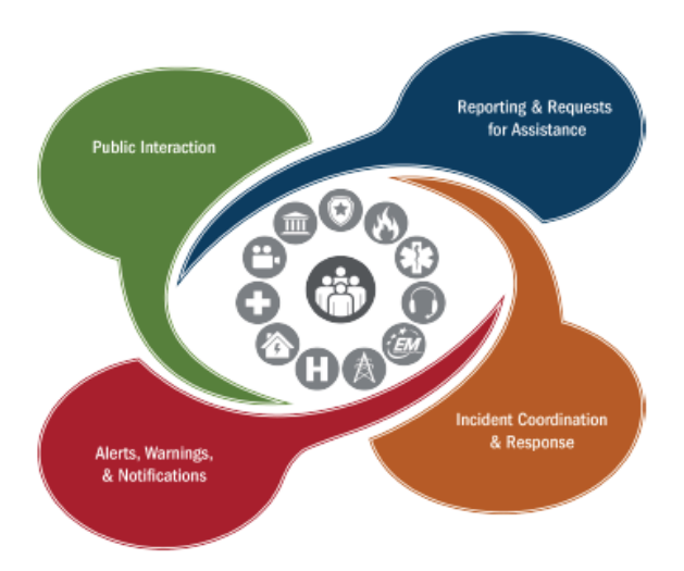
Figure 3. Emergency Communications Ecosystem

In April 2019, members of the Southwest Border Communications Working Group (SWBCWG) 7,8 decided to establish the Southwest Border Shared Communication Systems and Infrastructure (SCSI) Focus Group to examine regional considerations necessary for establishing a SCSI project in the region. From these discussions, the focus group developed recommendations organized around four key themes: (1) governance; (2) policy; (3) resource sharing; and (4) security. This report intends to inform decisionmakers and leadership across all levels of government on the SCSI concept and recommend the creation of a connected, interoperable network that leverages available "system of systems" technologies deployed in the region (e.g., land mobile radio [LMR], Long-Term Evolution [LTE], Wi-Fi, high frequency [HF] radio, microwave, wireline, satellite voice, video, Radio over Internet Protocol [RoIP], data communications systems) to improve communications for responders and the overall security of the Southwest Border.