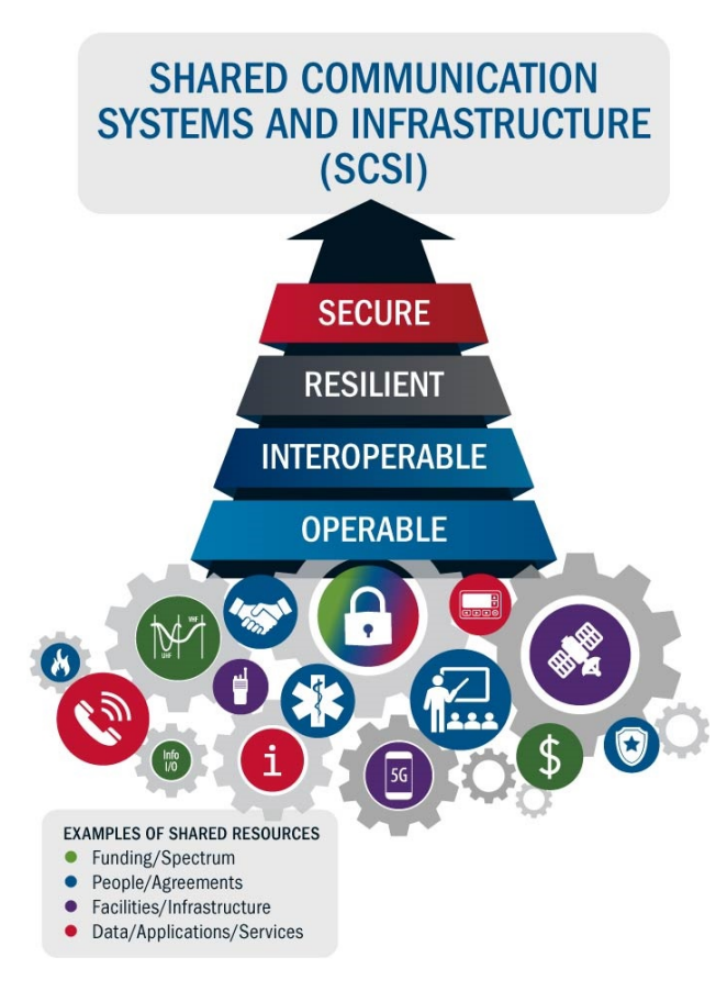
Figure 4. SCSI Overview

As a collaborative design effort, the Southwest Border SCSI project envisions a spectrallyefficient LMR network actively shared by FSLT users. This network's functionality may be augmented by Nationwide Public Safety Broadband Network (NPSBN) capabilities and potential infrastructure sharing through the First Responder Network Authority (FirstNet