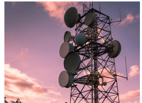
Image of a Radio Communications Tower

In 2011, the Department of Homeland Security (DHS) Office of Emergency Communications (OEC) released the Emergency Communications System Lifecycle Planning Guide (Lifecycle Guide) to better enable practitioners to plan for and deploy public safety communications systems. It defined system lifecycle phases, goals and products, stakeholder involvement, roles and responsibilities, and items for consideration in each phase. The Lifecycle Guide also provided recommendations for agencies interested in building, maintaining, and operating an emergency communications system through decommission and replacement. Since the 2011 Lifecycle Guide, the emergency communications ecosystem has evolved with new policies, stakeholders, advanced technologies, and critical risks impacting system lifecycle planning.