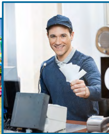
Figure 2: Outdoor event stakeholders