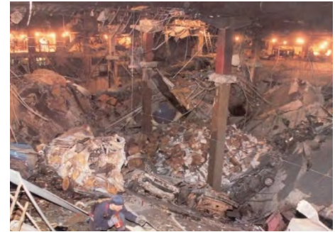
Figure 1: World Trade Center parking garage following the 1993 bombing that killed six people and injured 1,000

Goal 7: Safely coordinate response activities at IED incident sites. These C-IED tasks include activities by which outdoor events personnel can effectively and safely react at the IED incident site.