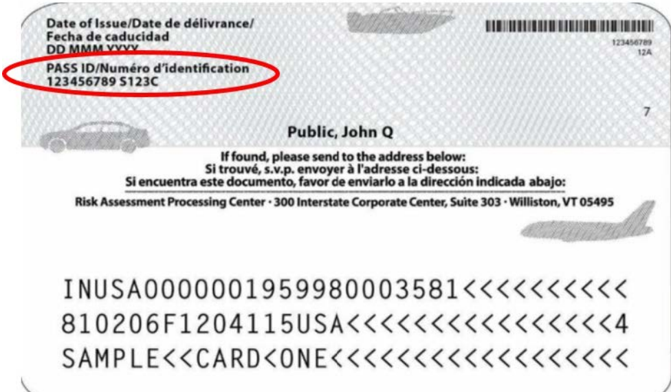
Figure 3: Trusted Traveler Program PASSID