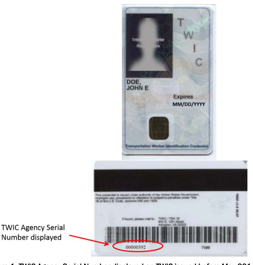
Figure 1: TWIC Agency Serial Number displayed on TWIC issued before May 2014

Using the example below, the number that would be input into the CSAT PSP application in the TWIC ASN data field is 00000392.