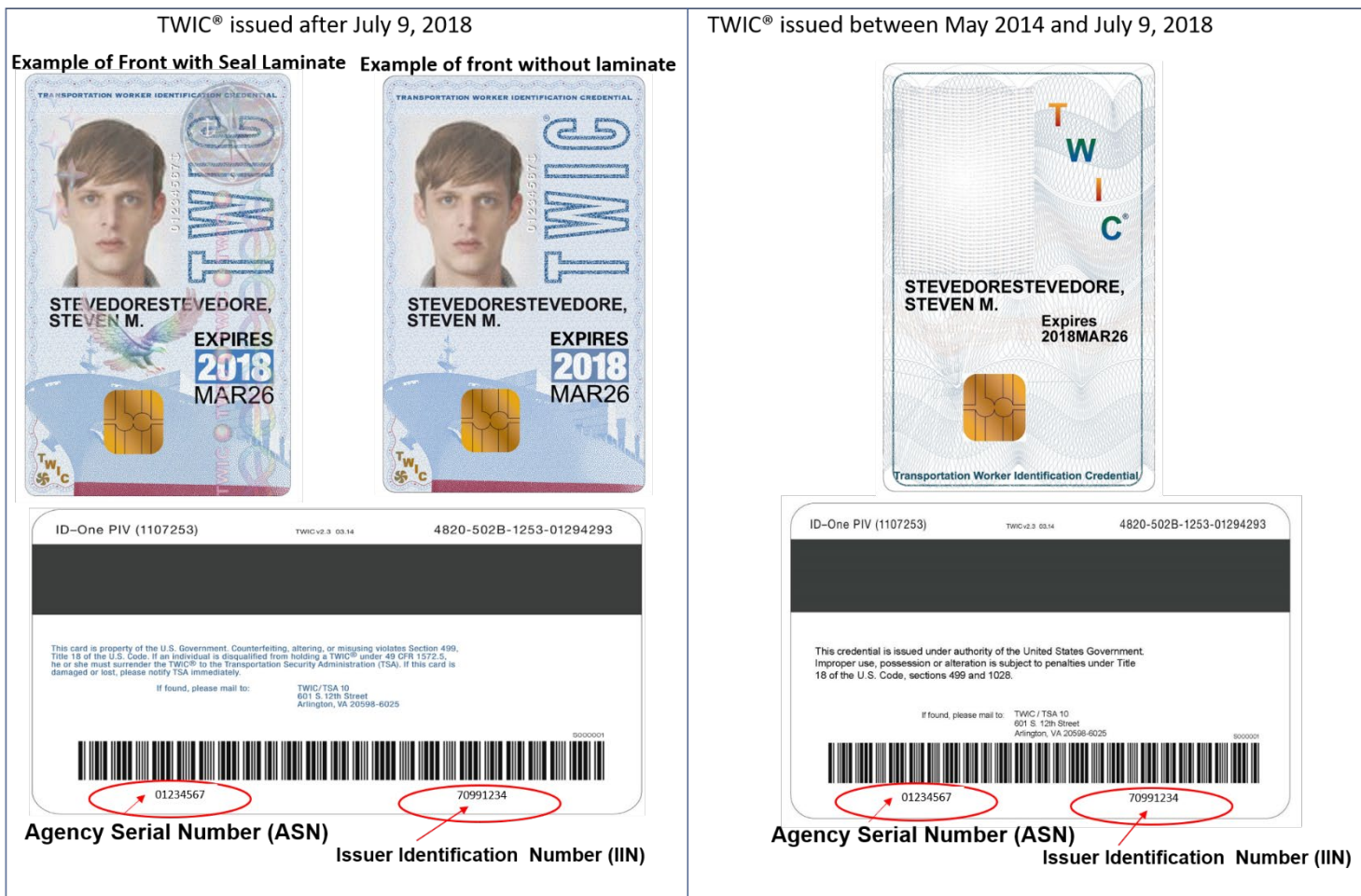
Figure 2: TWIC Agency Serial Number displayed on TWIC versions issued after May 2014

Using the examples below, the number that would be input into the CSAT PSP application in the TWIC ASN data field is 01234567.