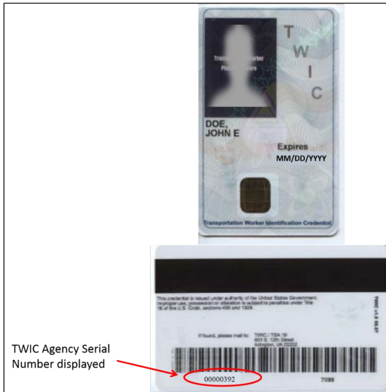
Figure 1: TWIC Agency Serial Number displayed on TWIC issued before May 2014

Using the example below, the number that would be input into the CSAT PSP application in the TWIC ASN data field is 00000392.