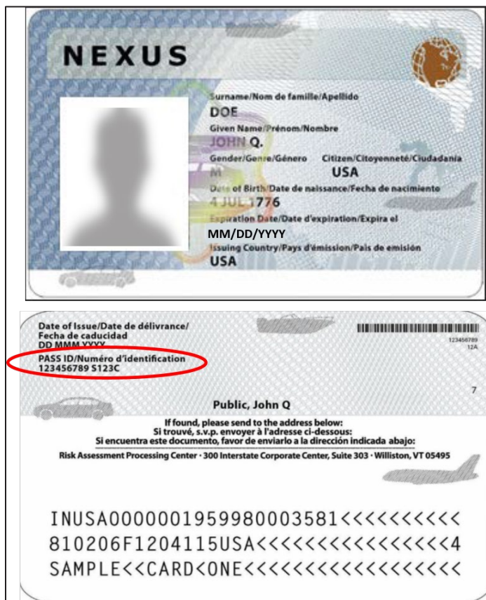
Figure 3: Trusted Traveler Program PASSID