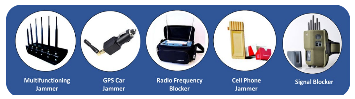
Figure 1. RF Jammer Examples

Outside the U.S., RF jamming devices are commercially available, however the cost and supported range varyies significantly by device. It is difficult to detect the presence of low powered jammers as they are often cheaply made overseas and emit inconsistent signals. Moreover, these devices, examples of which are outlined in Figure 1 below, are easily concealed, mobile, and can be effective in concentrated areas.