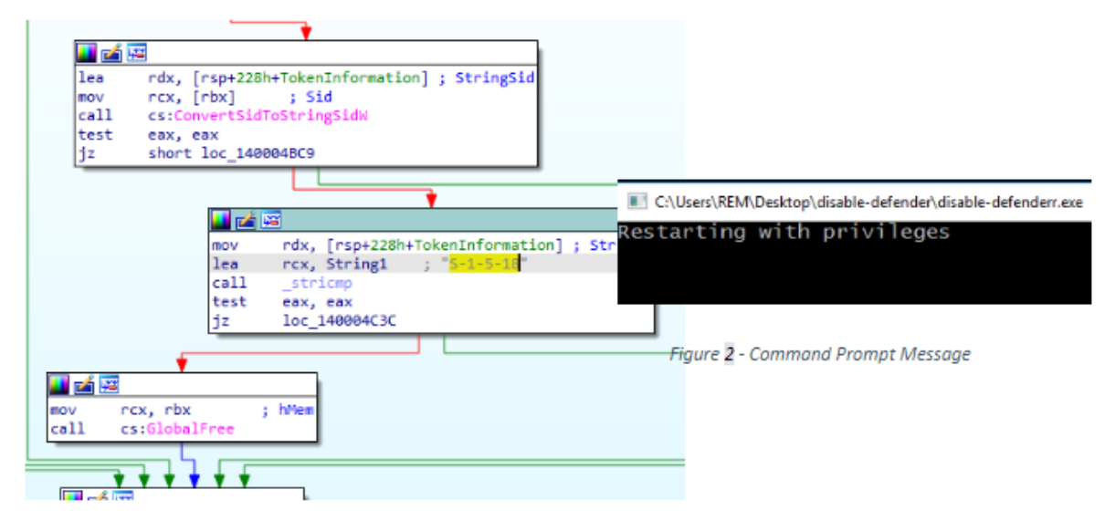
Test validate permissions

Upon execution, a command prompt is launched and a message is displayed if the process is not running as SYSTEM. The process is then restarted with the required permissions.