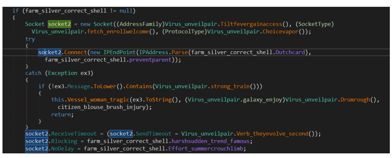
Second Socket Opened from POST Request

Sending a request to WV-RESET with a value will produce an OK response and call a function to shut down the proxy socket.