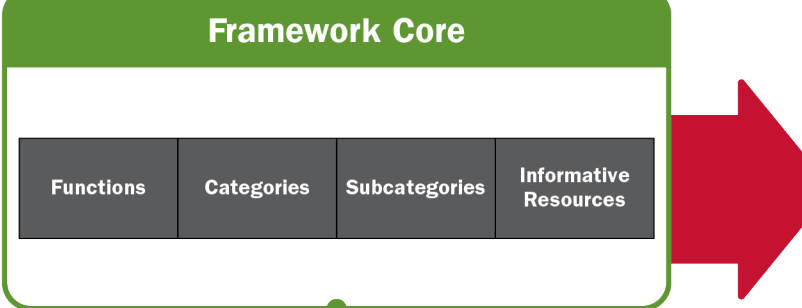
FIGURE 1. Framework Structure

The Framework Core is a set of cybersecurity activities, desired outcomes, and applicable references that are common across critical infrastructure sectors. The Core presents industry standards, guidelines, and practices in a manner that allows for communication of cybersecurity activities and outcomes across the organization from the executive level to the implementation/operations level.